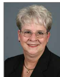
Betsy Wergin Commissioner Minnesota Public Utilities Commission